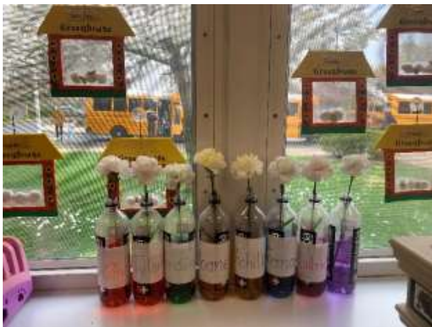
In Miss Kris' class, they dyed white carnations different colors by placing them in colored water! Also, they made green houses and grew seeds!