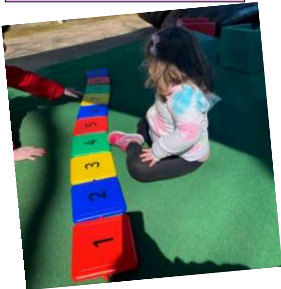
Miss. Eileen's class enjoyed the small playground and counted to 20!